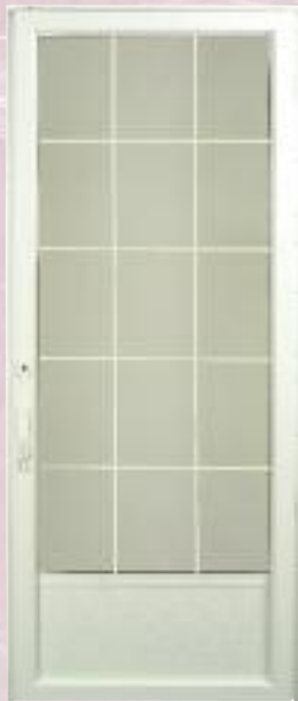
920 ONE-LITE CLASSIC-V-GROOVE 924 BRASS 925 SATIN SILVER