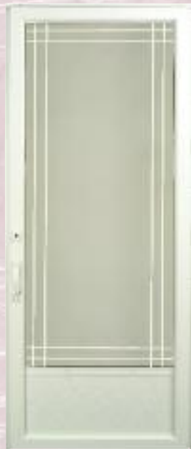
930 ONE-LITE BORDER-V-GROOVE 934 BRASS 935 SATIN SILVER