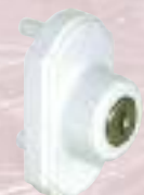
123 KEYED DEADBOLT