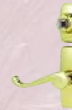
117 GEORGIAN LEVER BRASS