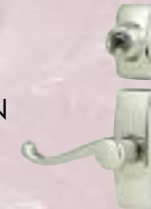
118 GEORGIAN LEVER SATIN SILVER

All DX and Georgian Lever brass and satin silver handles include a matching keyed deadbolt.