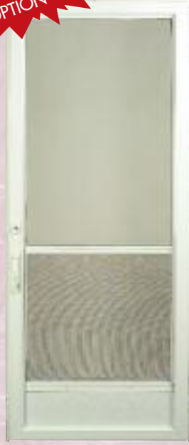
950 HI-VIEW 951 BRASS 953 SATIN SILVER 955 HI-VIEW HIDDEN VENT 956 BRASS 957 SATIN SILVER