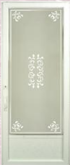
910 ONE-LITE FLORAL GLASS 914 BRASS 915 SATIN SILVER