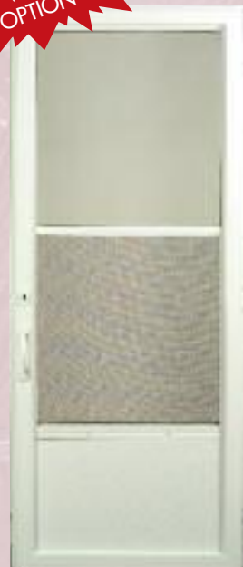
940 SELF STORING 941 BRASS 943 SATIN SILVER 945 SELF STORING HIDDEN VENT 946 BRASS 947 SATIN SILVER