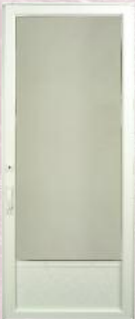
900 ONE-LITE 904 BRASS 905 SATIN SILVER