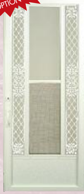
970 TRI-LITE FLORAL GLASS 971 BRASS 973 SATIN SILVER 975 TRI-LITE FLORAL GLASS HIDDEN VENT 976 BRASS 977 SATIN SILVER

Interchangeable screen included with One Lite & Full View doors