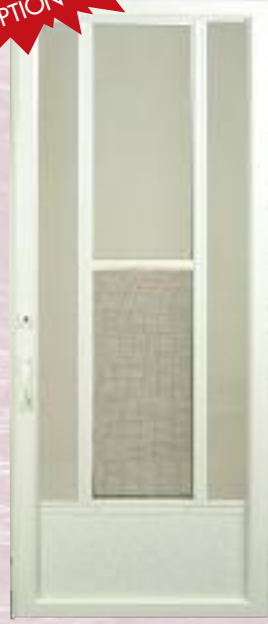
960 TRI-LITE 961 BRASS 963 SATIN SILVER 965 TRI-LITE HIDDEN VENT 966 BRASS 967 SATIN SILVER