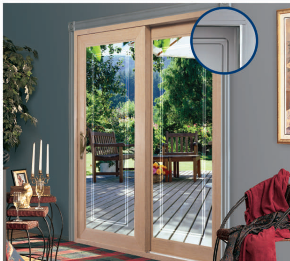
Clear Elegance V-groove glass The gliding door is available with an interior woodgrain stainable / paintable finish as an option.