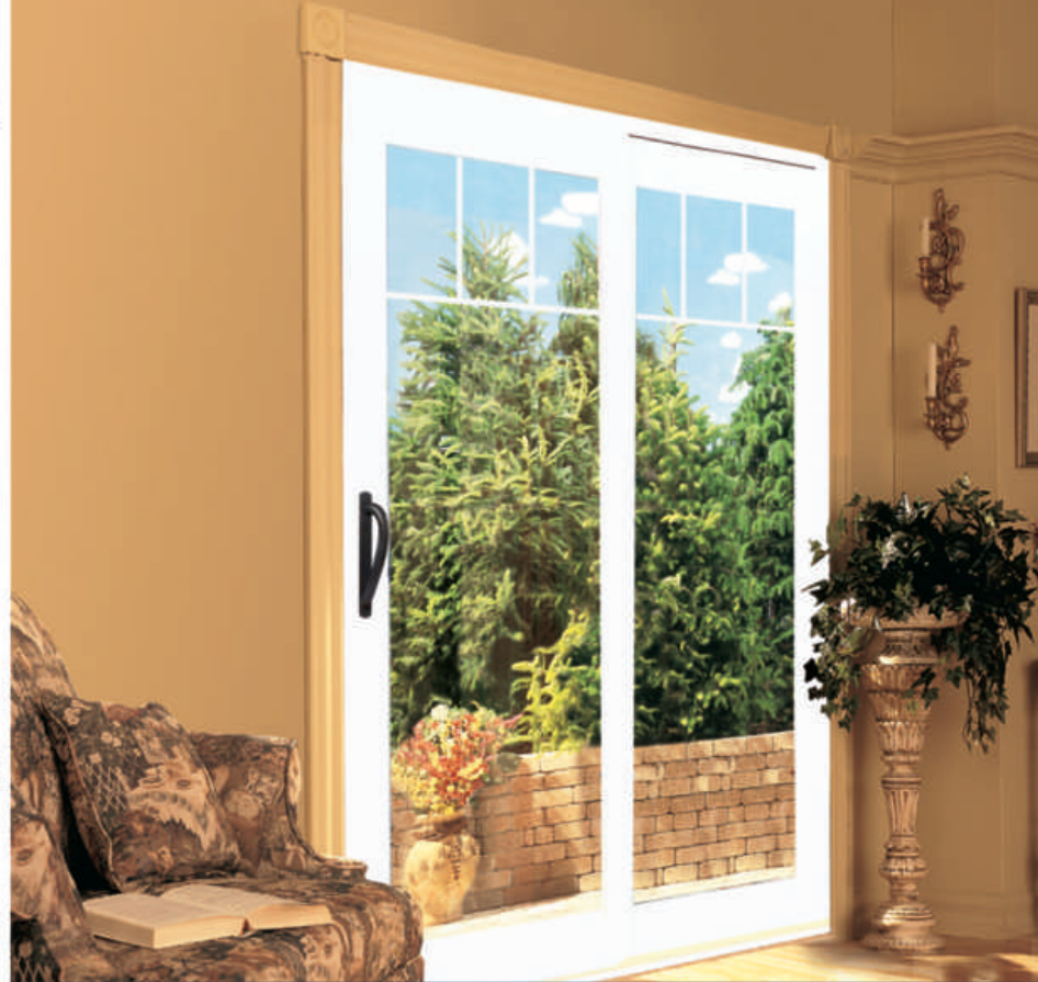
White Georgian 3X1 top grill