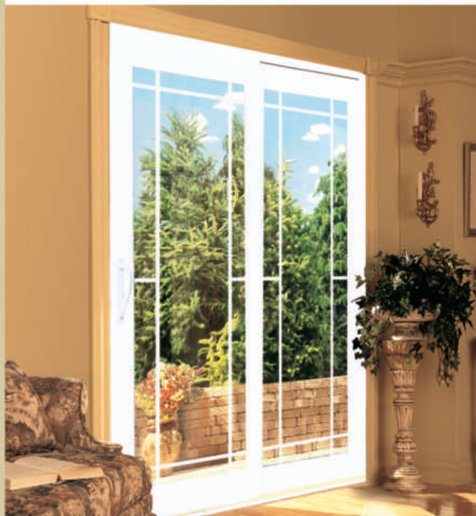
White Georgian perimeter grill (also available with 15-lite internal grills)