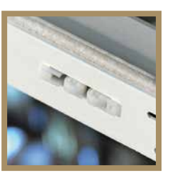
FLANGE METAL PIVOT PIN